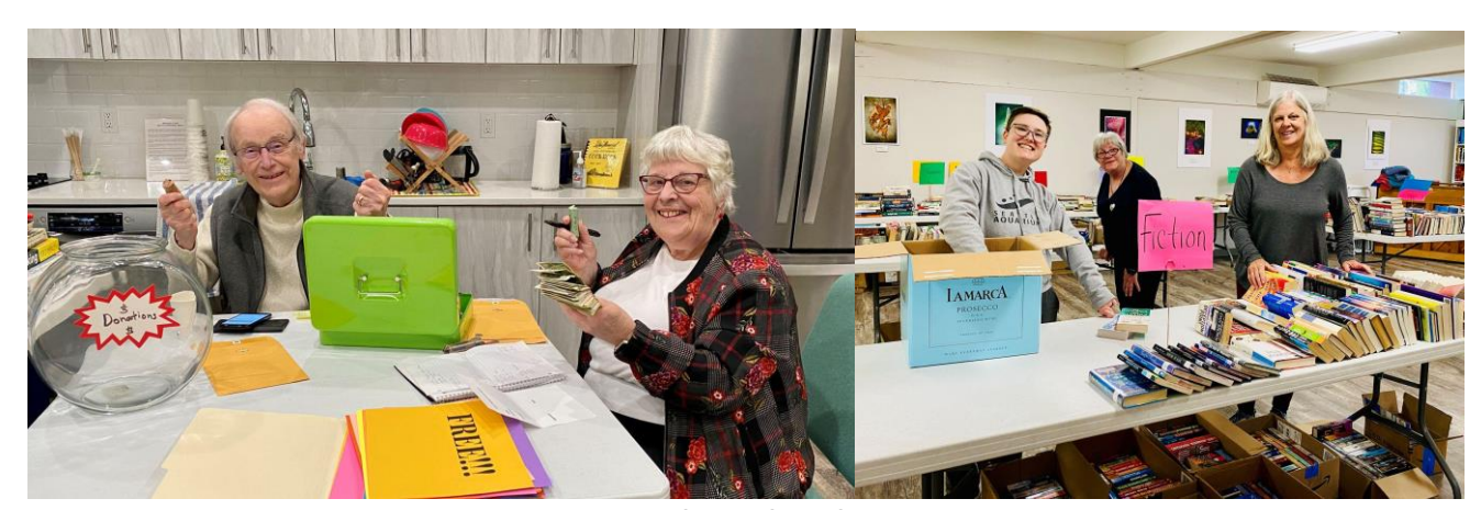
2nd Book Sale