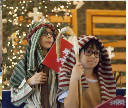
Children's Christmas Program 2019

THE LUTHER MEMORIAL MESSENGER is published by Luther Memorial Lutheran Church 13047 Greenwood Avenue N, Seattle, WA 98133 206.364.2510 | www.luthermemoralseattle.com office@luthermemoralseattle.com