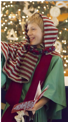
Too Many Shepherds!