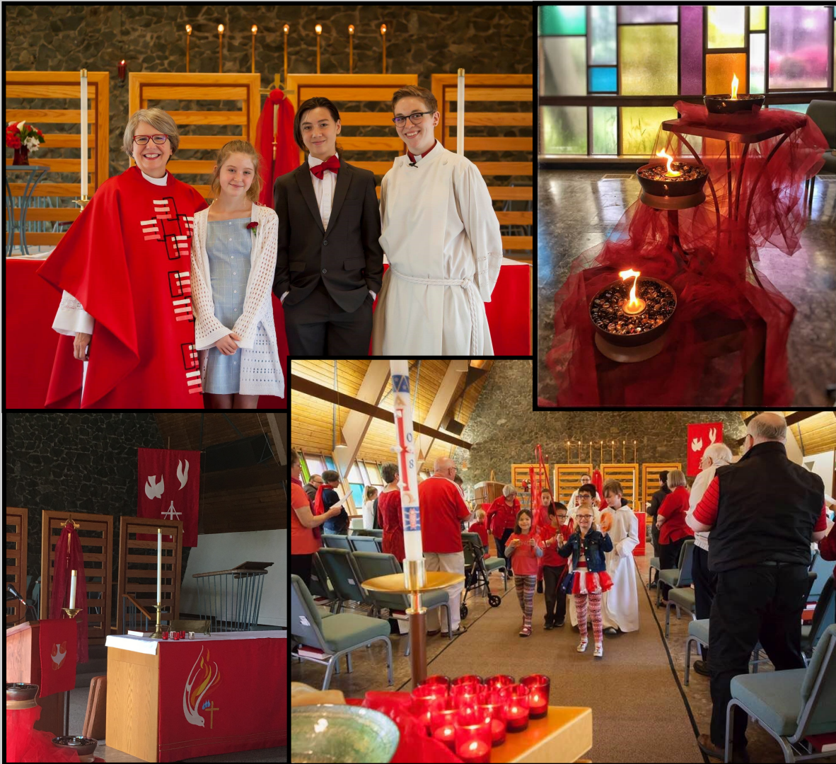
Pentecost Sunday / Affirmation of Baptism

THE LUTHER MEMORIAL MESSENGER is published by Luther Memorial Lutheran Church 13047 Greenwood Avenue N, Seattle, WA 98133 206.364.2510 | www.luthermemorialsattle.com welcome@luthermemorialsattle.com