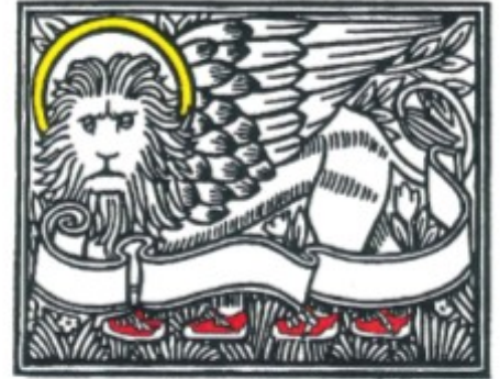
St. Mark's Choir School Summer Camp